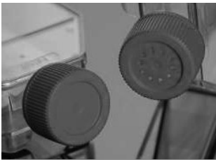
Vent caps and plug seal caps