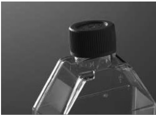
Vent caps with 0.22 µm hydrophobic filters to ensure gas exchange without contamination