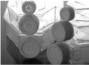
Yellow caps for non-treated flasks

NEST cell culture flasks are available in cell growth areas ranging from 25cm 2 to 225cm 2 . Tissue culture treated or non-treated flasks available with a vent cap or plug seal cap to meet your requirements. Vacuum plasma tissue culture treated provides optimum cell adherence. Non-treated flasks utilize yellow caps to be different from TC flasks which have teal caps. They are for suspension cell growth.